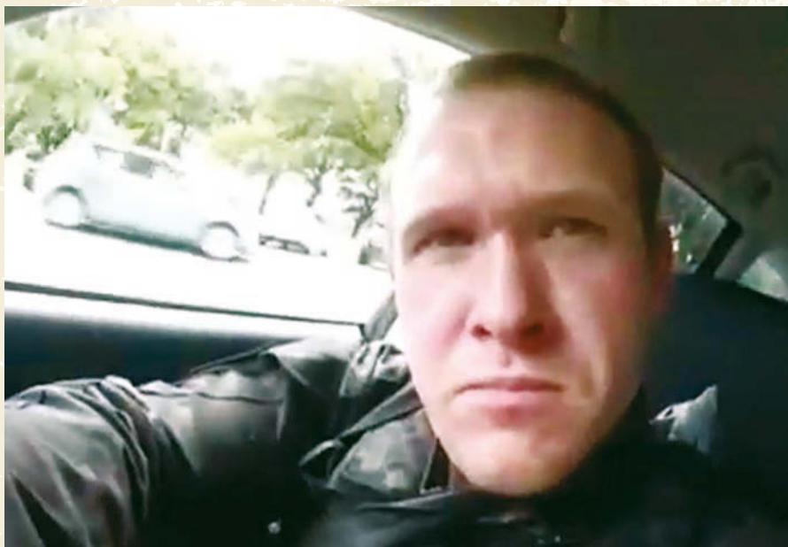
▲ Screenshot from Brenton Tarrant's live-streamed video.

▼ (Below left) NZ police arrest Tarrant. (Below right) Another man was arrested wearing combat fatigues but media said he had no connection to Tarrant.